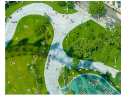
MEGA NOVA CITY WORLD PARK