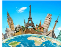
WORLD'S MONUMENT REPLICAS