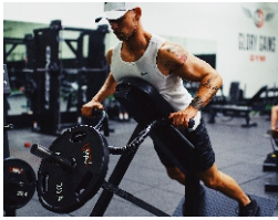
PROMOTING FITNESS & HEALTHY LIFESTYLE