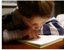
INTERNATIONAL STANDARD EDUCATION FACILITIES