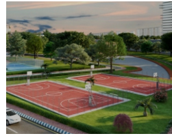
INTERNATIONAL STANDARD SPORTS FACILITIES